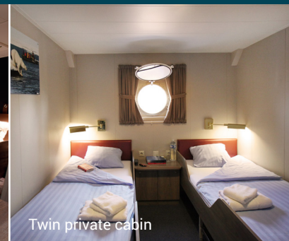
Twin private cabin